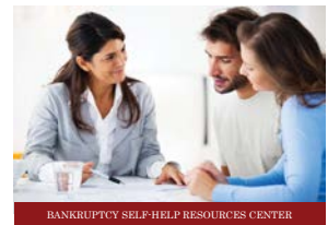
BANKRUPTCY SELF-HELP RESOURCES CENTER