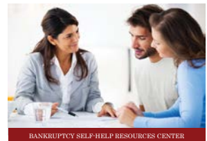
BANKRUPTCY SELF-HELP RESOURCES CENTER