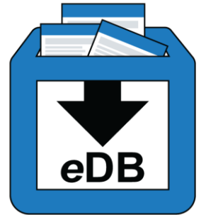
electronic Drop Box for "no fee" documents

To learn if your document requires a fee, go to Information>Filing Fees .